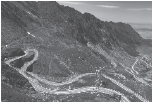
Fig. 2 – Clearings and excavations realized for the highway construction amplified the slopes' morphodynamic potential.