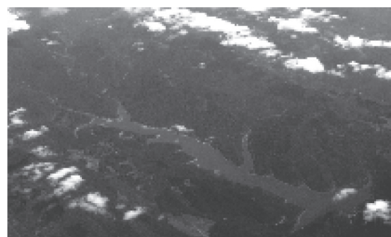
Fig. 3 – Hydro-energetic development from Vidraru, one of the most important within Meridionali Carpathians

power development from Fagaras Massif and even from the whole chain of Meridionali Carpathians (fig. 3). The water volume is collected from the massif's South slope, with a surface of 743 km 2 , from which only 286 km 2 cover the basin reception surface of Arges, the rest being represented by the basins of 9 rivers laterally collected by headrace [3]. The most important headrace is that which collects the waters from Raul Doamnei and Valsan basins, having a surface of 349km 2 , with a medium flow of 9,30m 3 /s. It is formed by more segments that pass from a valley into the other: Raul Doamnei Cernat headrace continues with Cernat-Valea cu Pesti headrace. This main headrace is digged up on above its whole way in crystalline schists.