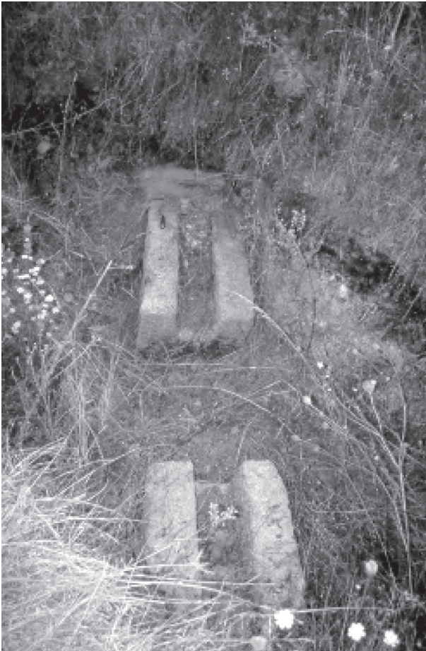
Fig. 3 Two granite blocks from the conduct of the Western aqueduct accidentally found in the urban area of Ammaia.

of Ammaia. Once inside the walled city area, probably after passing a not-yet discovered castellum aquae , the aqueduct can be linked to a granite specus of exactly the same type, which was hazardously found in situ, West of the forum area some years ago (figure 3). Information on aerial photographs and results from the recent georadar survey allow us now to connect it to the area of the forum and its monumental bath-house.